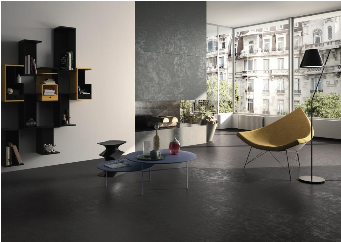
Flooring and coverings: Resina Black