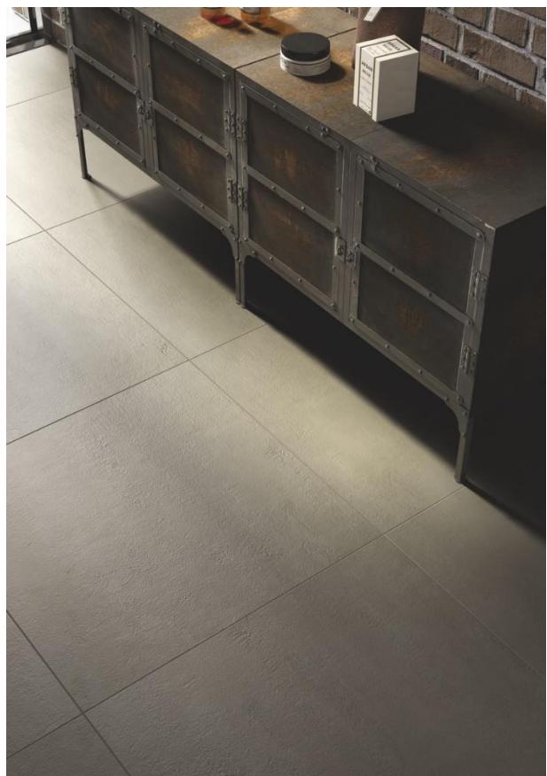
Flooring: Beton Mud