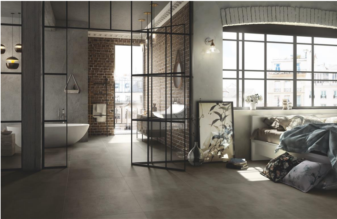
Flooring: Beton Mud

But the defining feature of industrial chic is the open space loft where walls are replaced by room dividers, bookcases, or furniture. The higher ceilings are often used to create mezzanine floors. Large windows and industrial features, such as concrete finishes, are other distinctive elements.