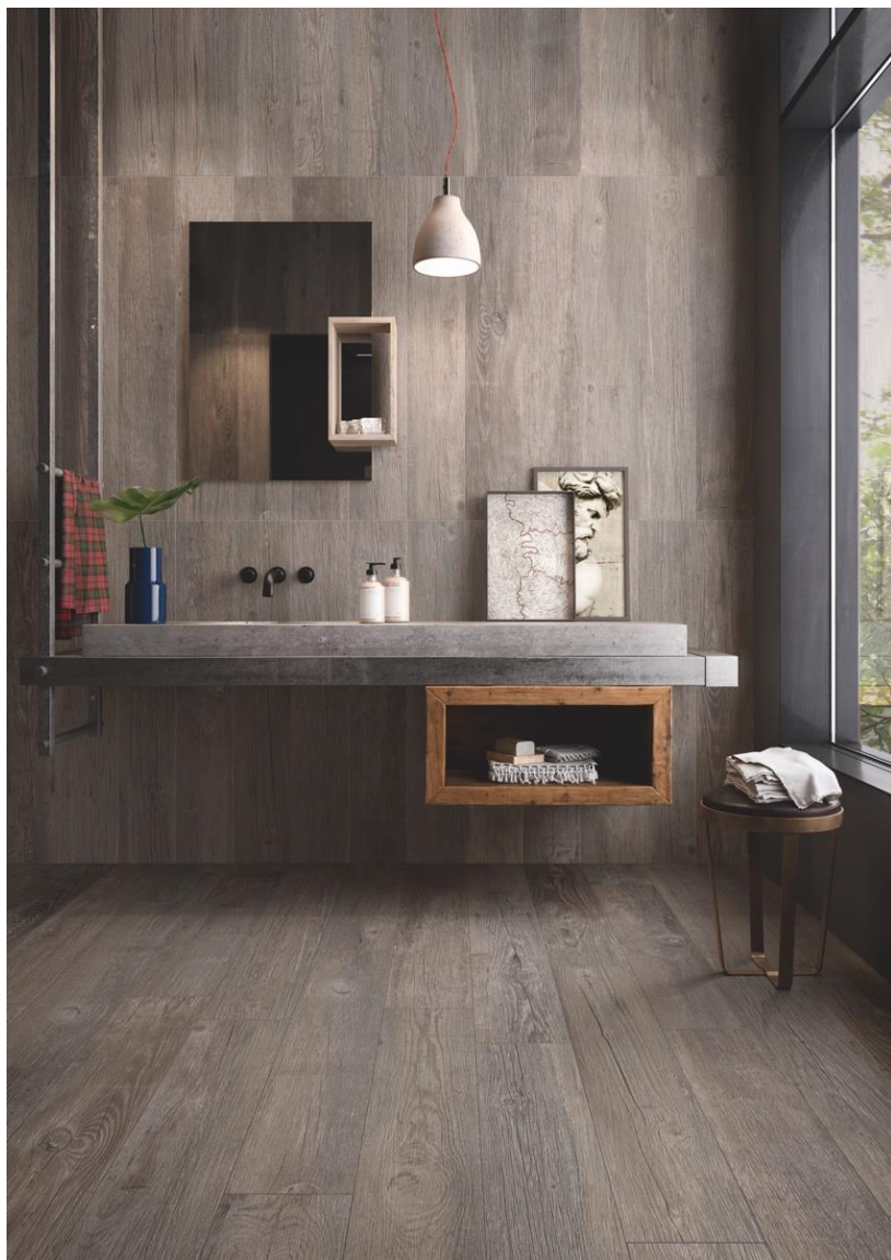
Flooring and coverings: Country Wood Tortora